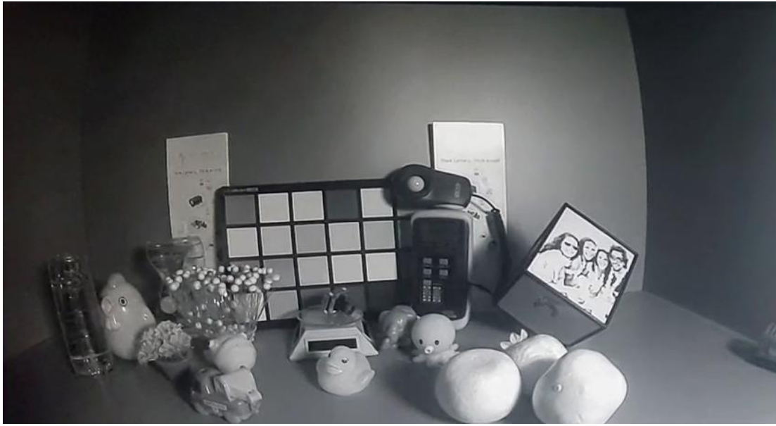
Fig 3: Light Source: Infrared

e-con Systems distributes a sample camera viewer, running on the Ubuntu distribution of Jetson TX2 development board, leveraging on NVIDIA's 'libargus' camera APIs that demonstrates the video preview and still capture capabilities. e-con's Full HD IMX290 camera module along with the adapter board allows developers to incorporate this camera in to their designs, in a turnkey basis, with ease.