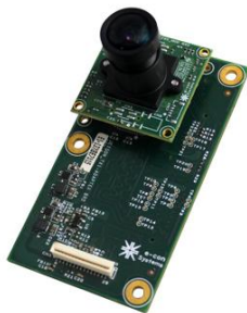
Fig 1: e-CAM21_CUTX2 – 2MP Ultra-Low light MIPI camera

ST. LOUIS, USA and CHENNAI, India – Jan 24, 2018, e-con Systems Inc. , a leading imaging solutions company and NVIDIA® Preferred Partner announces the launch of the much-awaited SONY STARVIS® series IMX290 CMOS Sensor based MIPI CSI-2 camera module for NVIDIA® Jetson TX2 developer kit – e-CAM21_CUTX2 . The STARVIS® is back-illuminated pixel technology used in Sony CMOS image sensors for Smart Surveillance camera applications. Its excellent low-light sensitivity realizes high picture quality in the visible-light and near infrared light regions. e-CAM21_CUTX2 produces outstanding visibility under the starlight. The IMX290 is a RGB 10/12-bit Bayer format image sensor that can stream 1080p @ 120fps. e-con Systems partnered with NVIDIA® to develop this camera leveraging the powerful Image Signal Processor of NVIDIA TX2. e-con Systems worked closely with NVIDIA on the driver development, image sensor characterization and ISP tuning for realizing excellent image quality under various lighting conditions including near darkness. The e-CAM21_CUTX2 camera is an ideal camera for smart applications powered by Machine Learning and Deep Learning technologies on the powerful Tegra X2 platforms including smart surveillance, smart parking and other innovative applications requiring cameras with excellent image quality.