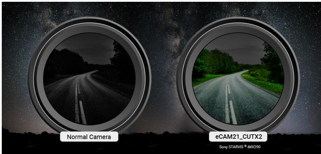
Fig 3: Comparison of e-CAM21_CUTX2 - Sony IMX290 MIPI camera vs Normal low-light camera

NVIDIA Preferred Partner, e-con Systems has pioneered in bringing out various cameras for NVIDIA Jetson TX2 kit. Earlier, e-con Systems had launched e-CAM30_HEXCUTX2 - Six Synchronized Full HD Cameras, e-CAM131_CUTX2 - 13MP UltraHD camera, 4MP RGB-IR camera, e-CAM31_TX2 - 3.4 MP Liquid Lens Autofocus camera and e-CAM30_CUTX1 - 3.4MP low light sensitive camera boards for NVIDIA Jetson TX1/TX2.