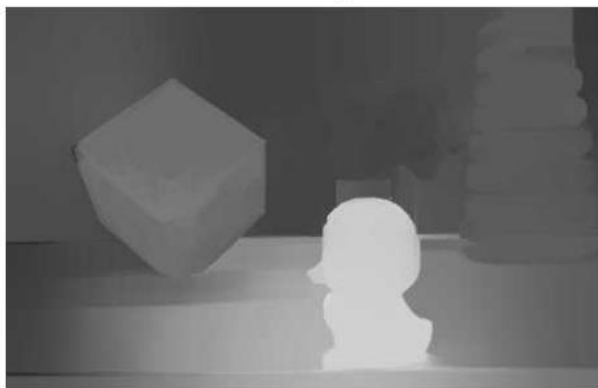
Grey Depth Map