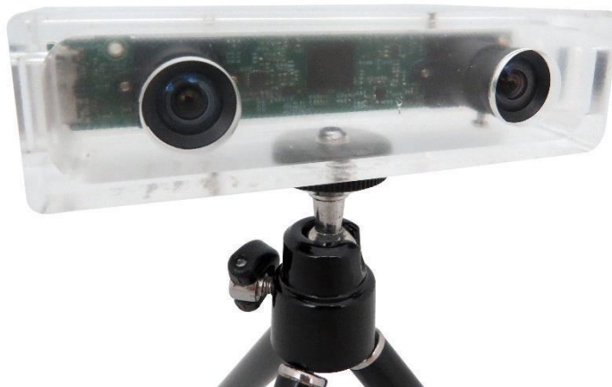
Fig: TaraXL - USB 3.0 Stereo Vision Camera with Pre-calibrated Lens

TaraXL is bundled with a proprietary CUDA® accelerated Stereo SDK called TaraXL SDK that runs on the GPU of NVIDIA® Tegra processors. The SDK can provide 3D Depth map for 752 X 480 @ 50 fps without stressing the CPU. The SDK supports two modes of operations, one is high accuracy mode which supports depth mapping @ 25 fps and the high frame rate mode supports depth mapping up to 50 fps. e-con Systems also provides sample applications with source code, demonstrating synchronous stereo image streams, disparity map and depth measurement. Customers can build their depth sensing based applications on top of this SDK and with TaraXL stereo cameras on NVIDIA Tegra platforms.