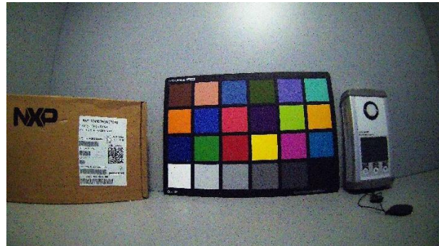
e-CAM80_CUNX - SONY STARVIS™ IMX415 MIPI Camera at 2.5lux