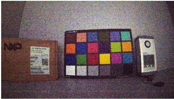
e-CAM80_CUNX - SONY STARVIS™ IMX415 MIPI Camera at 0.4 lux

The color images captured at 0.4 lux and 2.5 lux using e-CAM80_CUNX MIPI camera kit are given below: