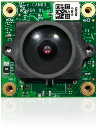
Fig:1 8MP camera module with lens

“Next generation of Smart Surveillance cameras powered by NVIDIA Jetson, demand high resolution 4K video for monitoring of large area and our e-CAM83_CUMI415_MOD will be the ideal camera for these applications thanks to its excellent low light capability and 4K video streaming. The first-in-the-segment feature of 4K streaming video at 90 fps Jetson AGX Xavier platform marks e-CAM83_CUMI415_MOD as an ideal solution for AI sports cameras, drone camera photography and many applications requiring high resolution and high frame rates.” said Ashok Babu, President of econ Systems, Inc.